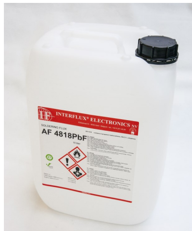
Products pictured may differ from the product delivered

In general it should be the goal to apply just enough flux in order to minimize residue formation after the soldering process. This is being done