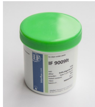
Products pictured may differ from the product delivered

IF 9009 LT is low in halogens and is classified as RE/L1 according to IPC J-STD-004A.