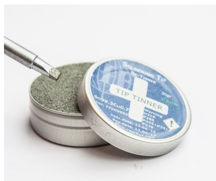
Products pictured may differ from the product delivered

Small emissions of smoke are inherent to the process. As for any hand soldering operation, an air extraction is advised.