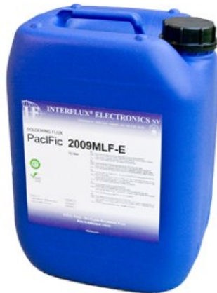
Products pictured may differ from the product delivered

PacIFic 2009MLF-E is perfectly suitable for lead-free soldering and is typically applied by spray-fluxing.